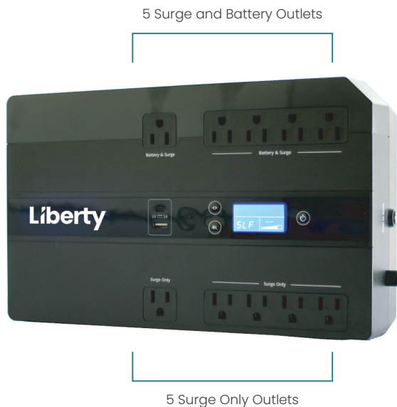
900 VA Standby Desktop UPS

The Liberty LUPS-SB900D is a standby VRLA UPS providing 900 VA of backup power to protect small-load electronics from damage. It's a compact desktop unit with battery support, spike and surge protection, built-in self-diagnostics, and more.