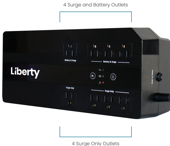
450 VA Standby Desktop UPS

The Liberty LUPS-SB450D is a standby VRLA UPS providing 450 VA of backup power to protect small-load electronics from damage. It's a compact desktop unit with battery support, spike and surge protection, built-in self-diagnostics, and more.