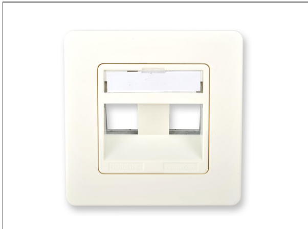
Everon® Copper Datacom Frame Set, 3 ports, inclined, for up to three x Everon® Copper Datacom xs500 Keystone Copper Jacks, 50x50 mm, white