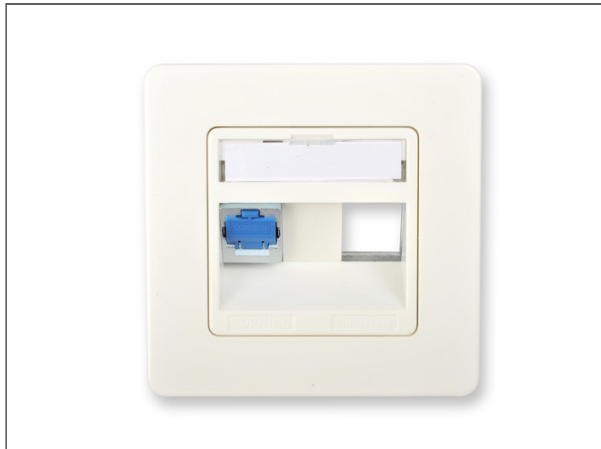
Everon® Copper Datacom Frame Set, 3 ports, inclined, for up to three x Everon® Copper Datacom xs500 Keystone Copper Jacks, 50x50 mm, white