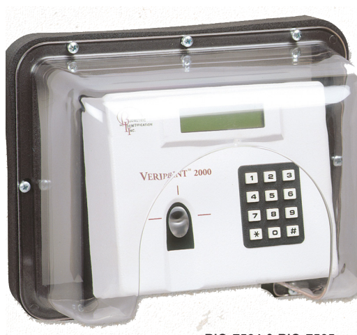
BIO-7504 & BIO-7505