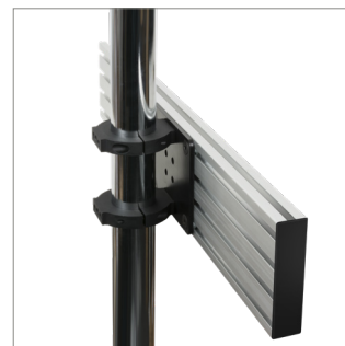
Use BT8390-CFK collar fixing kits and B-Tech collars & poles to create ceiling or floor-to-ceiling installs