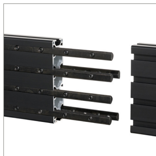
Multiple lengths can be joined together using BT8390-EXT (available separately)