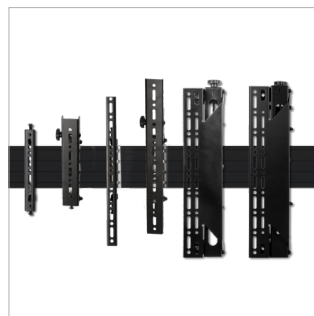
Compatible with a variety of interface arms and collar compatible accessory mounts