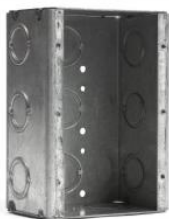
3 Gang Flush Mount back box