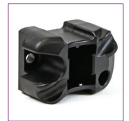
Palm Guard Insert