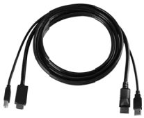
CK-6P DP KVM cable, 6 ft 4K 60Hz