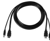
CK-6H HDMI KVM cable, 6 ft 4K 60Hz