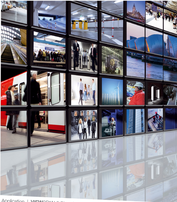
Application | VIEWSPAN 6 Plus® is designed for high resolution, video wall installations