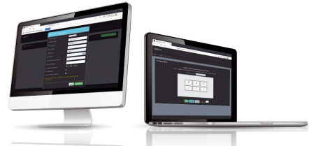
Configuration and Control via web browser interface

Multiple VIEWSPAN ® devices can be integrated to drive large numbers of monitor screen displays.