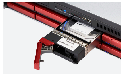
HOT-SWAP HARD DRIVERS