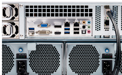
IO PANEL with 4 display port - dual LAN ports - Audio IN/OUT - SAS Expander