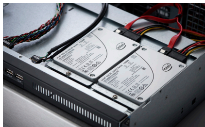
DUAL SSD for OS and APPS