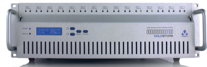
COLDSTORE 3U Front Panel includes LCD system info and disk status LEDs

COLDSTORE 3U is ideal for projects requiring affordable high storage capacity, extended disk lifetimes, long file-retention and simple system management.