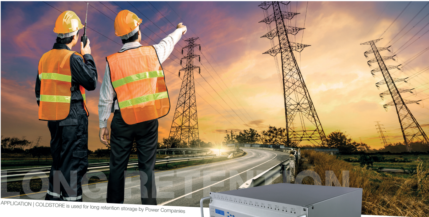
APPLICATION | COLDSTORE is used for long retention storage by Power Companies

The world's most reliable surveillance storage system designed to perfectly preserve the veracity of your IP video