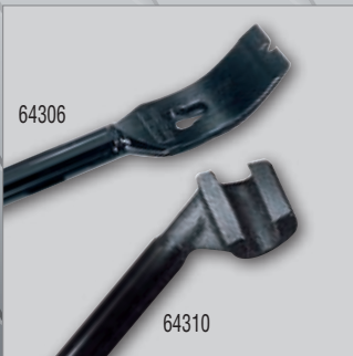
Hickies & Grizzly Bar

Klein Tools' line of Ironworker's tools are engineered and manufactured to withstand rugged jobsite conditions and heavy use. From pliers to wrenches, rebar hickies to pins, leather and canvas pouches to connecting bars, each tool has been thoughtfully designed around the worker. Whether it's rebar work or structural work, Klein has something to meet the Ironworker's daily needs.