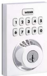
Polished Chrome 26 9GED18000-030