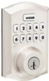
Satin Nickel 15 9GED18000-026