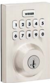
Satin Nickel 15 9GED18000-029