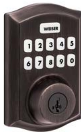
Venetian Bronze 11P 9GED18000-027