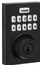
Matte Black 514 9GED18000-031