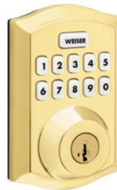
Polished Brass 3 9GED18000-028