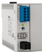
POWER SUPPLY 100-240VAC/24VDC 4A