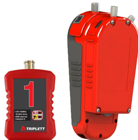
VTM-Kit (remote included)