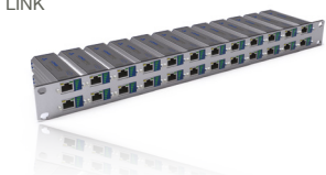
Up to 24 LONGSPAN units can be mounted in a 1U rack space. Ask for VLS-1U.

Distances may be increased by connecting multiple links in series. Data rate at full range stated: 100Base-TX = 200Mbps, 10Base-T = 20Mbps