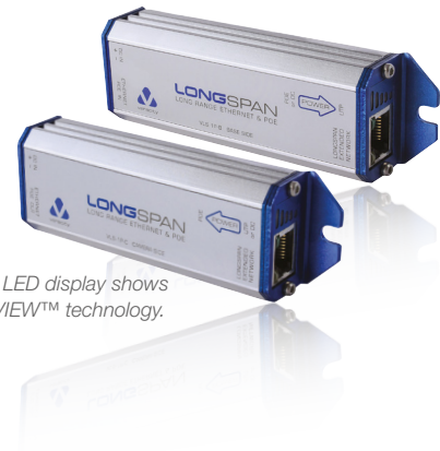
Smart LED display shows SAFEVIEW™ technology.

LONGSPAN delivers unrestricted 100Base-TX with 802.3af and 802.3at POE at distances far beyond the normal Ethernet limits for problem-free IP camera installation.