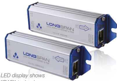
Smart LED display shows SAFEVIEW™ technology.

LONGSPAN delivers unrestricted 100Base-TX with 802.3af and 802.3at POE at distances far beyond the normal Ethernet limits for problem-free IP camera installation.