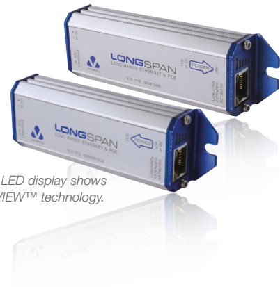
Smart LED display shows SAFEVIEW™ technology.

LONGSPAN delivers unrestricted 100Base-TX with 802.3af and 802.3at POE at distances far beyond the normal Ethernet limits for problem-free IP camera installation.