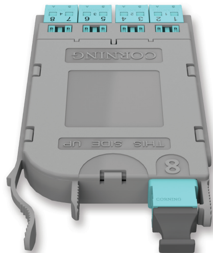
EDGE8 MTP to LC Duplex Module | Photo REN424