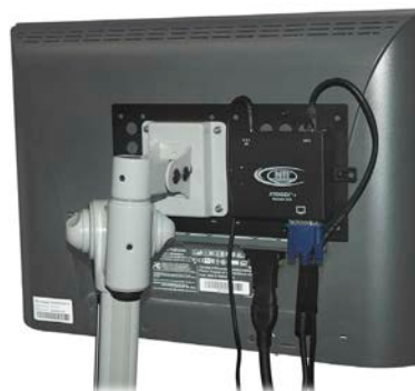
Remote unit mounted to the back of a flat panel monitor using ST-C5MK-VESA mounting kit