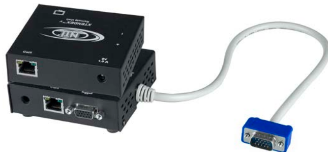
XTENDEX® ST-C5V-600 (Remote & Local Unit)