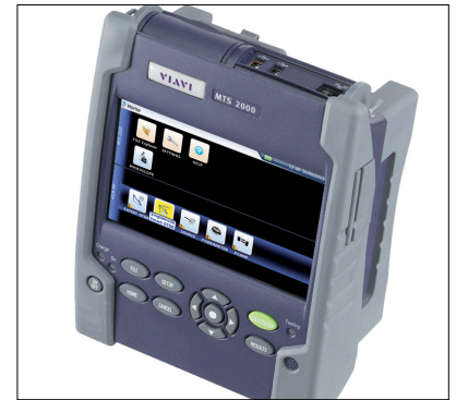
For fiber testing and certification capabilities, combine the Certifier10G with one of the market-leading Viavi fiber testers, such as the T-BERD/MTS-2000