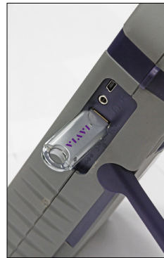
USB flash drive supports transferring test results