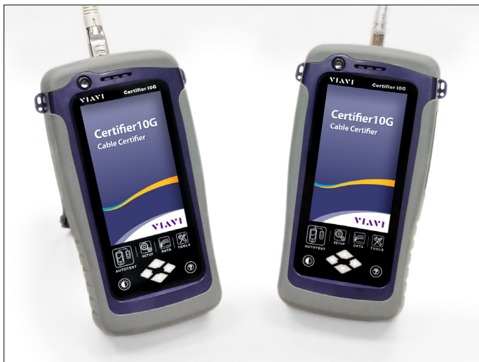
Two complete units minimize time initiating, naming, and saving results

*Append model number with -NA, -UK, -EU, -AU for regional power cords.