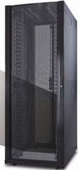
AR3140 – 42U Height