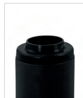
^ Rubber gasket lamp holder