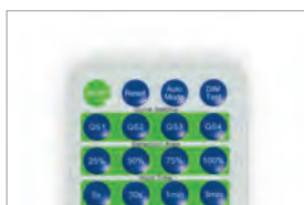
LEV71805 (see p.335) Toughbay microwave remote