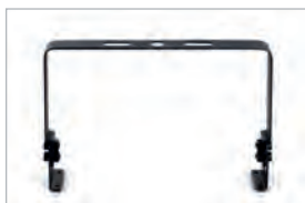
JC71840 Surface mount bracket