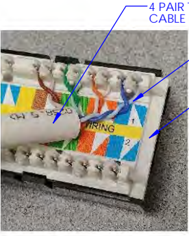
4 PAIR TWISTED CABLE