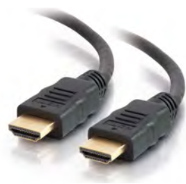
1m High Speed HDMI® with Ethernet Cable