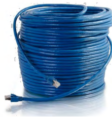
30m Cat6 Booted Unshielded (UTP) Network Patch Cable