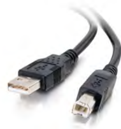
1m USB 2.0 A/B Cable