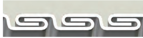
Interlocked Design 1-1/2" through 4" with no bonding wire