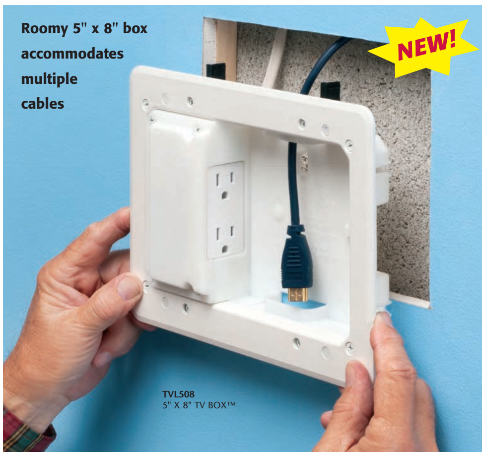
TVL508 5" X 8" TV BOX™

Arlington's low profile 5" x 8" TV BOX™ is ideal for flat screen TV installations on 1/2" or 5/8" drywall with wall cavity depths 3/4" and larger. Applications in new work or retrofit include: