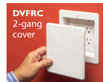
DVFR3C 2-gang cover