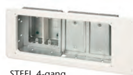
STEEL 4-gang TVBS613