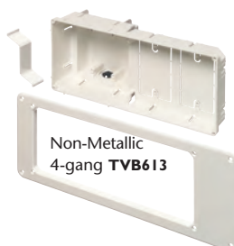
Non-Metallic 4-gang TVB613