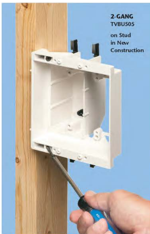
2-GANG TVBU505 on Stud in New Construction