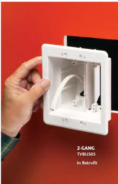
2-GANG TVBU505 in Retrofit