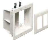
Non-Metallic 2-gang TVBU505