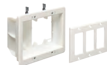
Non-Metallic 3-gang TVBU507