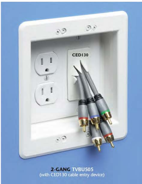
2-GANG TVBU505 (with CED130 cable entry device)