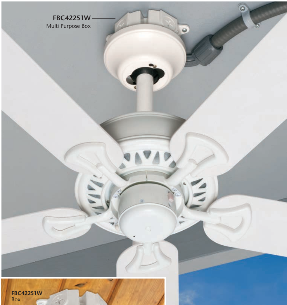
FBC42251W Multi Purpose Box

Raintight, Sealed Box for Wet or Damp Exterior Locations