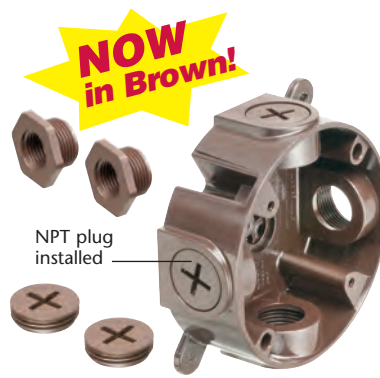
FBC42251BR Box components Includes screws for fan installation

Arlington's non-metallic 21.8 cu. inch MULTI PURPOSE BOX is the labor-saving solution to installing a fan, light fixture or security camera that's exposed to the elements – inside or outside. This MULTI PURPOSE BOX eliminates the need for time-consuming field modifications.