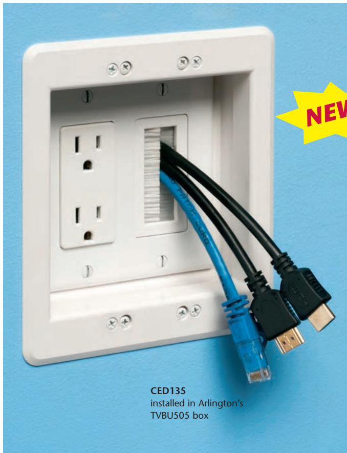
CED135 w brush opening

The Attractive Way to Organize and Protect Cable