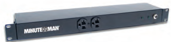
Surge Suppressor Power Distribution Units - MMS Series (MMS1020HV, 20-Amp, horizontal/vertical unit shown)

By adhering to the same philosophies and quality standards used in the design of uninterruptible power supplies, Simplicity, quality and value have been brought to products that supply rack and cabinet power to today's sophisticated network installations.