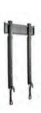
LTTU Tilt Mount for 37 - 63" displays