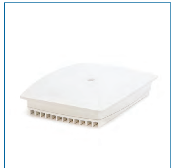
SCRN-310 | Figure 1

As the demand for mobile broadband accelerates, mobile network operators need to efficiently utilize both UMTS and LTE technologies, without creating new network complexity. The SpiderCloud® scalable small-cell system, called an enterprise radio access network (E-RAN), hides the complexity of radio management and mobility and provides operators with a single touchpoint to aggregate and manage a large network of UMTS, LTE, and multiaccess (UMTS and LTE) small cells.