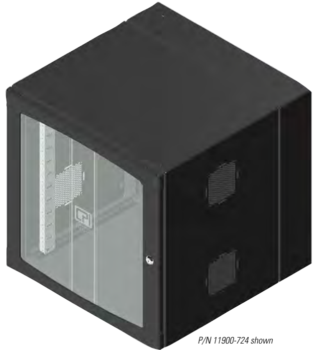
P/N 11900-724 shown

Note: X=Color; 7=Black and E=Glacier White