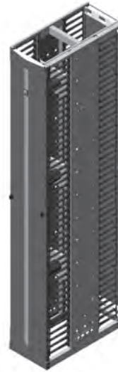
Evolution g2, Double-Sided Vertical Manager