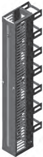
Evolution g3, Combination Vertical Manager