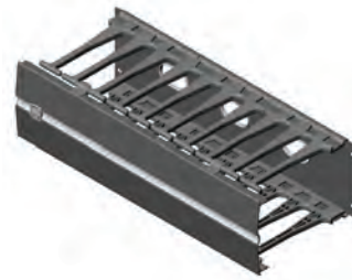
35441-XXX, with cable openings