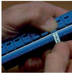
Dispenser filled with one roll each legend 0 thru 9. \triangle