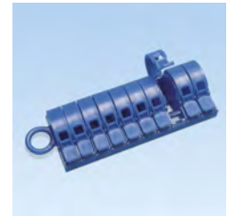
PM D EMPTY DISPENSER