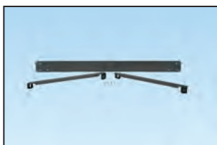
Vertical Wall Adapter