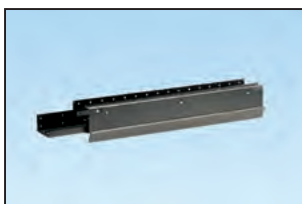
Single and Set of Two Wall Beams