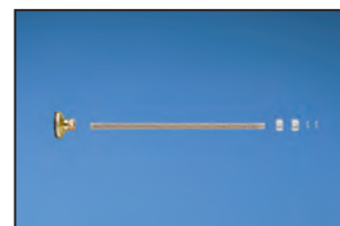
Mid-Span Cabinet Support