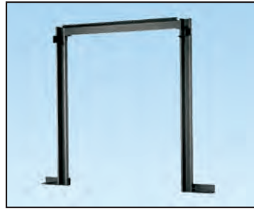
End of Row Frame (two per System)