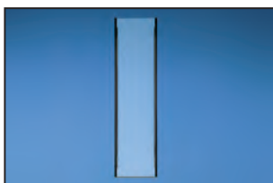
Full Length Blanking Panel