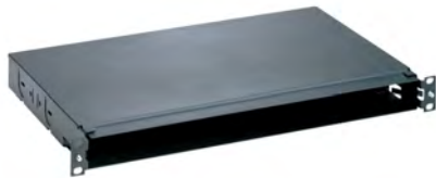
Opticom® Rack Mount Fiber Trays