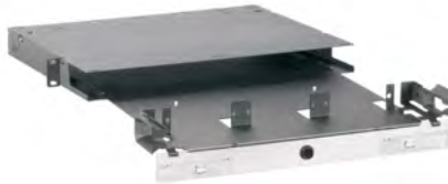
Opticom® Rack Mount Fiber Enclosures