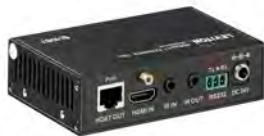
Transmitter — back