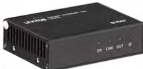
Receiver — front