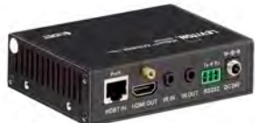
Receiver — back