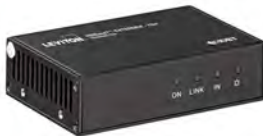
Transmitter — front

Extend HDMI signals up to 70 meters (230 feet) over a single category-rated cable for applications in classrooms, conference rooms, control centers, and public venues where reliable high-definition video is needed. The certified HDBaseT technology supports a complete professional plug-and-play installation that includes HD video, bi-directional, power, bi-directional IR, multi-channel audio, and RS-232 control.