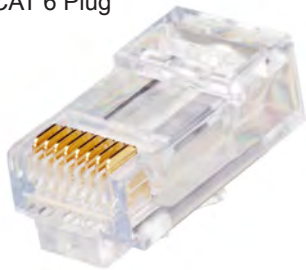
EZ-RJ45 CAT 6 Plug

The EZ-RJ45 CAT 6 Plug and Crimp Tool provides quick, cost-effective UTP wire terminations. The plug features openings that allow wires to be inserted and extended out of the front, providing increased performance, wire sequence verification, and no wasted connectors, crimps, or bad terminations. The crimp tool features a built-in cutter and stripper that crimps and cuts wires in one operation. It accommodates EZ-RJ45 plugs, and most standard RJ-45 and RJ-11 plugs. This craft-friendly tool features precision ground crimp dies, a full cycle ratcheting mechanism, and steel construction for strength and durability.