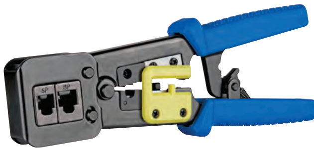
EZ-RJ45 Crimp Tool

For a copy of Leviton product warranties, visit www.leviton.com/warranty .