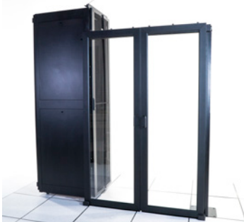
Sliding Doors with Adjustable Mounting Post