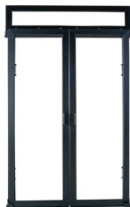
Sliding Doors with Optional Transom Window