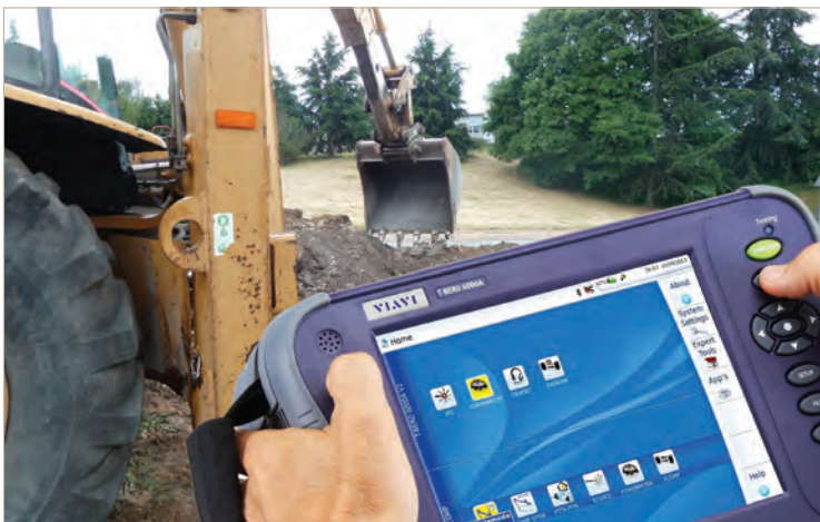
Portable and upgradeable platform with interchangeable test modules increases technician productivity

The flexibility of interchangeable module carriers and various plug-in modules let users create a platform that meets today's specific testing needs and yet it can evolve seamlessly to meet tomorrow's ever-changing network requirements.