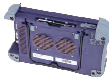
E6300 transport and fiber module carrier