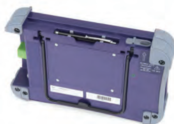
E6100 fiber module carrier