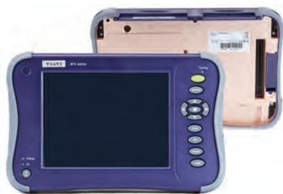
Back of the module carrier where other modules are attached

The multidimensional design of the T-BERD/MTS-6000A (V2) provides optimal configuration flexibility with extended battery life. The E6100 module carrier is best suited for fiber applications; whereas, the high-powered battery in the E6200 module carrier extends battery life when used with the carrier Ethernet (MSAM) or other intensive fiber applications.