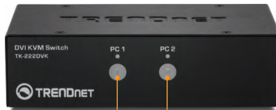
PC selector buttons