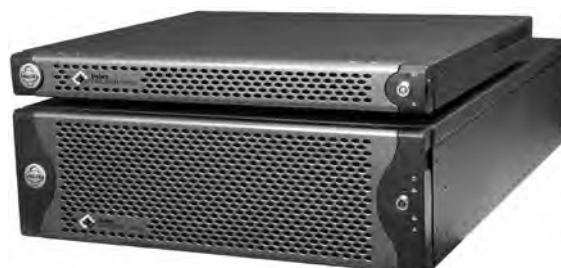
ENC5300 (TOP) AND DVR5300 (BOTTOM)