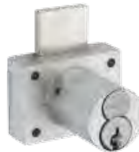
Drawer lock - CL888R

Rekeyable: Easily rekeyed via patented set-screw cylinder mechanism