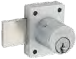
Cabinet door lock - CL100PB

Rekeyable: Easily rekeyed via patented set-screw cylinder removal mechanism