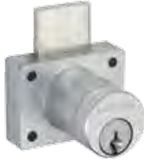
Drawer lock - CL200PB

Rekeyable: Easily rekeyed via patented set-screw cylinder removal mechanism