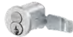
Cam lock - CL920R