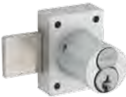
Cabinet door lock - CL777R

Rekeyable: Easily rekeyed via patented set-screw cylinder mechanism