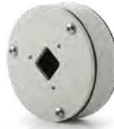
Gasket included (not shown in photo)