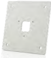
Gasket included (not shown in photo)