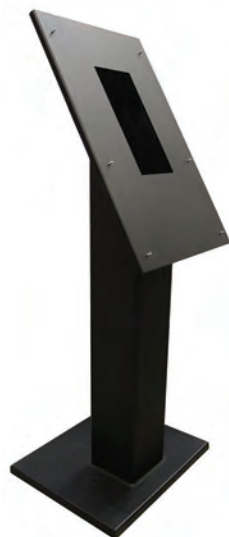
TX3-T-KIOSK2 Optional Black Pedestal