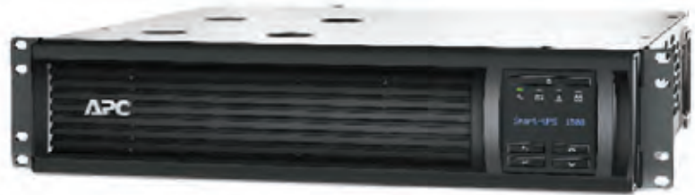
[ SMT1500RM2U ]