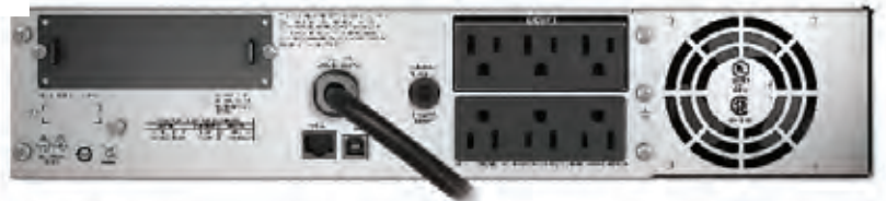
[ SMT1500RM2U ]