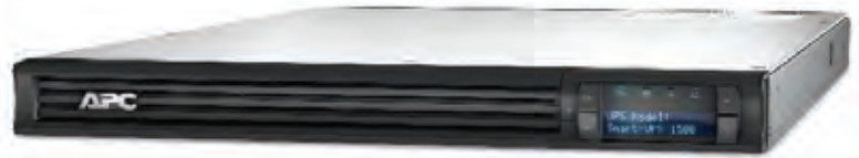
[ SMT1500RM1U ]

Application-optimized standard models, ideal for servers, storage, point-of-sale, and other network devices