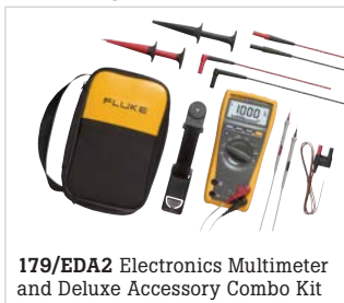
179/EDA2 Electronics Multimeter and Deluxe Accessory Combo Kit